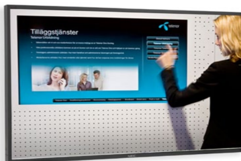
P401-DST / P461-DST

Note: Many more of NEC's desktop, large format LCD's and projectors are also touch capable. Look for this feature in the detailed specifications of related products.